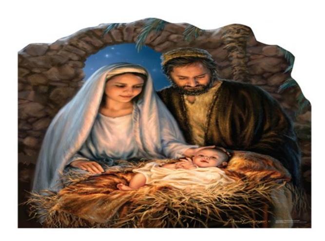
"for today in the city of David there has been born for you a Savior, who is Christ the Lord (Lk 2:11)

like a day that is only in the calendar with no value. Later the expression want to justify their faith, taking the Bible as their question, as: Where does this great celebration that we call "Christmas" come from? is the word "Christmas" found in the Bible? Why celebrate Christmas on December 25th? These are the questions that many people of our time want to know, which will make the body of our reflection in this article: the meaning of Christmas, why celebrate Christmas on December 25th and what is Christmas for us today?