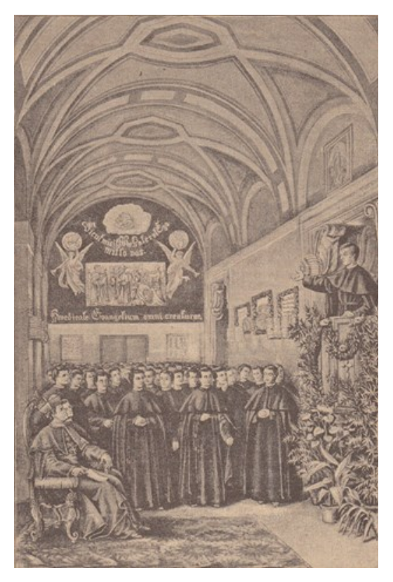
A view in the refectory of the Motherhouse, Feast of Languages 1889

In the Missionär of the year 1889, we read on one of the first Feasts of Languages: "The order of the different languages was as follows: Latin, Ancient Greek, Hebrew, Syriac, Ethiopian, Arabic, Armenian, Chinese, Italian, Spanish, Portuguese, German, English, Russian, Polish, Turkish (a dialogue), Dutch, Modern Greek, Danish and Bohemian. Alternately, some singing lectures were given every now and then, including a song as sung by the Brahmins in India." It might be that the diversity and the number of languages and cultures in our community is not that extended as in the early community of the Motherhouse in 1889, but notwithstanding that, it is impressive.