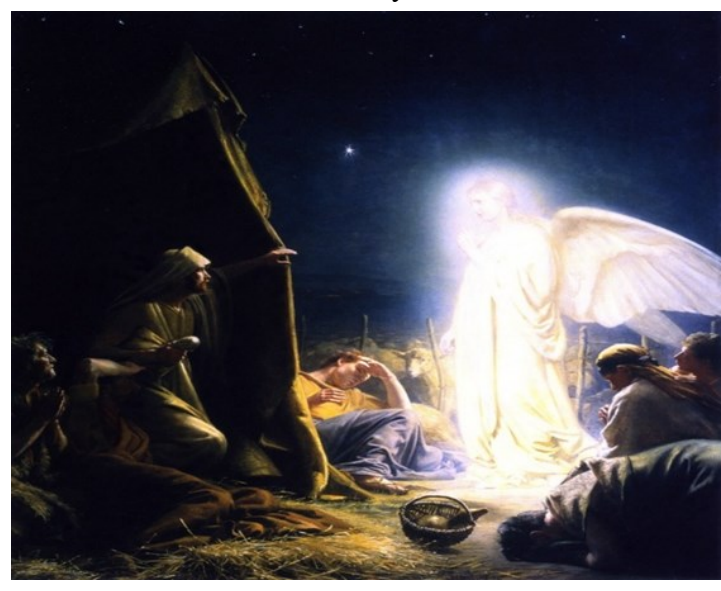
3. What is Christmas for us today?

seen the light at a later time, when Christians began to birth. But since these two Gospels do not place this centuries chose the date of December 25th. It is what is Christmas for us today?